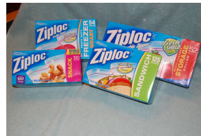
Ziplock bags (2 gallon or gallon or quart or sandwich or snack)